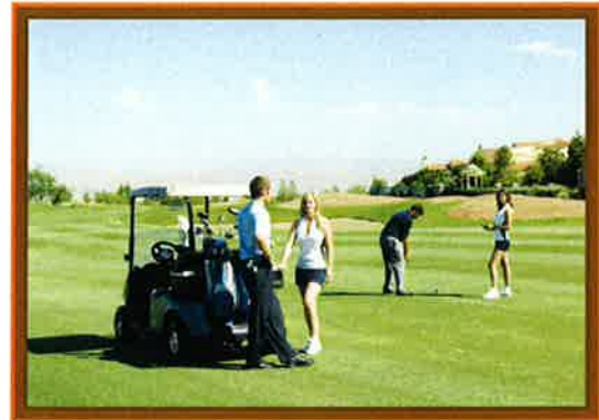
T-Mates will help players while they're playing, but also when they're waiting. Here on #18!