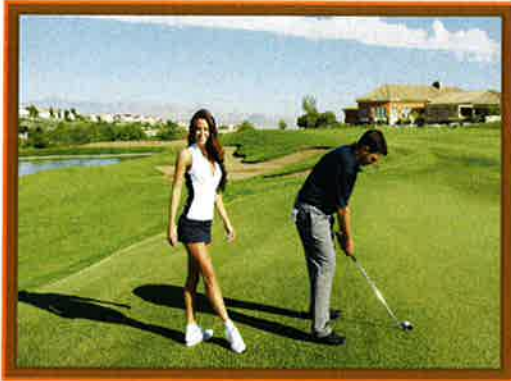
T-Mates will give you exact yardages making club selection easy. Play with confidence.

As a special guest of Rio Secco we want to alert your guests to a very special program. Rio Secco is pleased to announce it's T-Mate program. Guests of Rio Secco can reserve a T-Mate who will serve as your golf concierge and host/hostess during your round. For more information on this exciting program visit our website http://www.riosecco.net/newpage.asp?id=138&page=2883 or call the golf shop at (888) 867-3226 x1